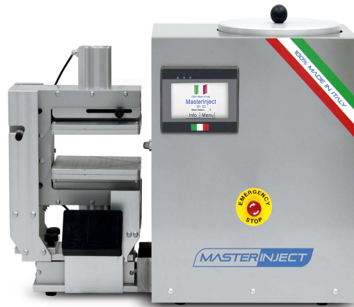
MI - 01